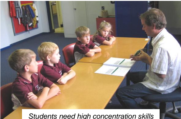
Students need high concentration skills in the Mini Lit class

I hope everyone enjoyed the public holiday on Monday. I would like to begin my blog with a reminder about hats. Several students are regularly coming to school without their hats and as such, they are reliant on a school spare hat or have to miss outside activities. Lyrup Primary School is a 'No Hat, No Play' School in accordance with government education regulations. Please could you help your child by ensuring they have their hat at school and that the hat is clearly labelled with their names.